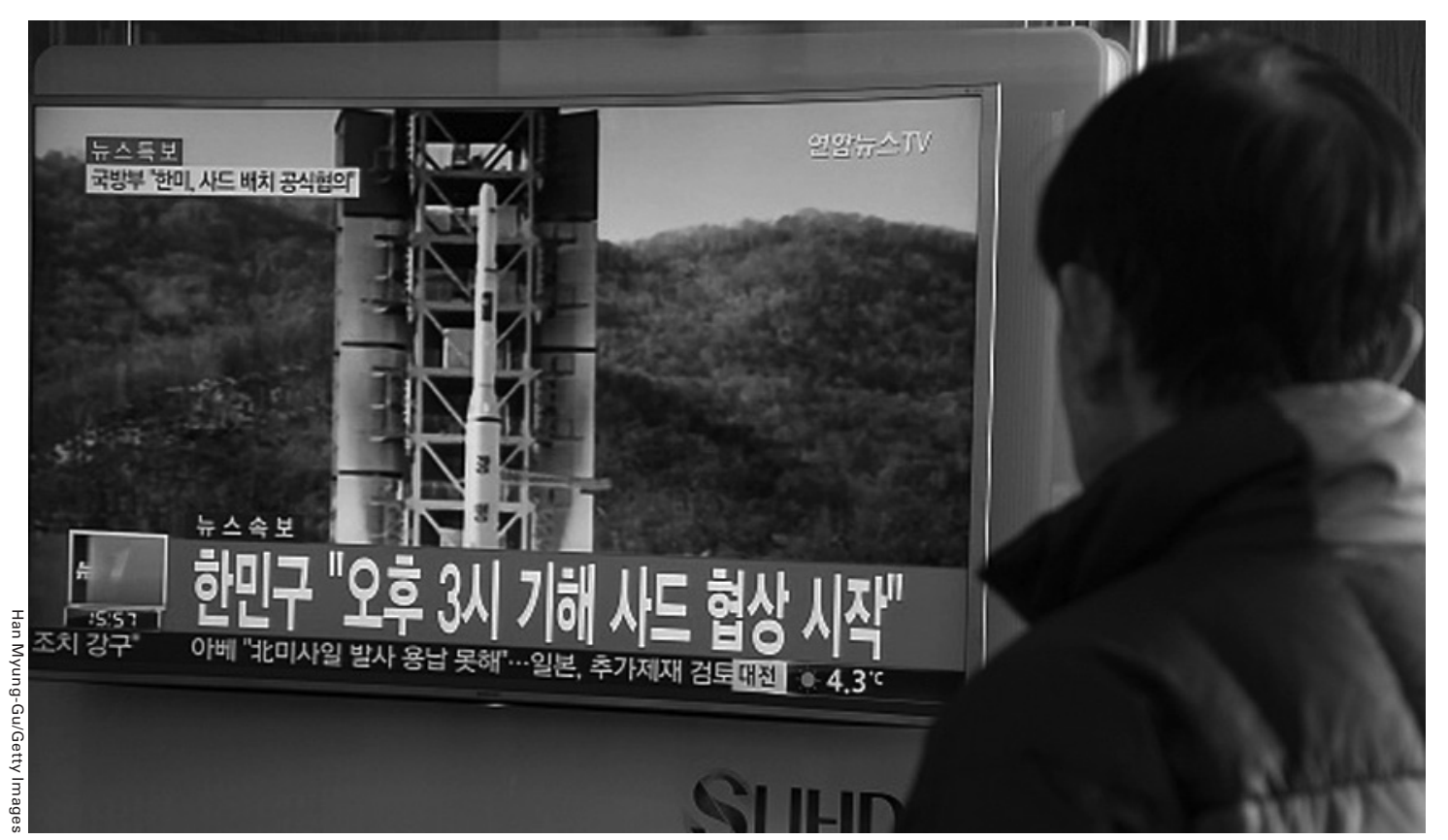
A public television screen in Seoul, South Korea shows breaking news on North Korea's February 7, 2016 satellite launch. The launch contravened UN Security Council demands that North Korea not conduct any launch using ballistic misille technology.

The United States, in concert with close allies South Korea and Japan, has sought to deter North Korean military moves by retaining considerable combat forces in South Korea and the region (albeit now without nuclear weapons) and maintaining them in a high state of readiness. During the last dozen years, Washington has sought to