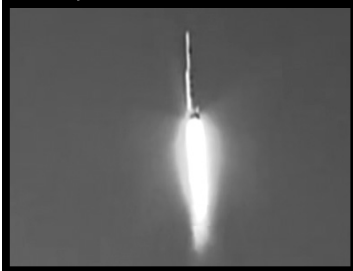
The January 7, 2016 launch of the Kwangmyongsong SLV, as shown on North Korean Television (KCTV).