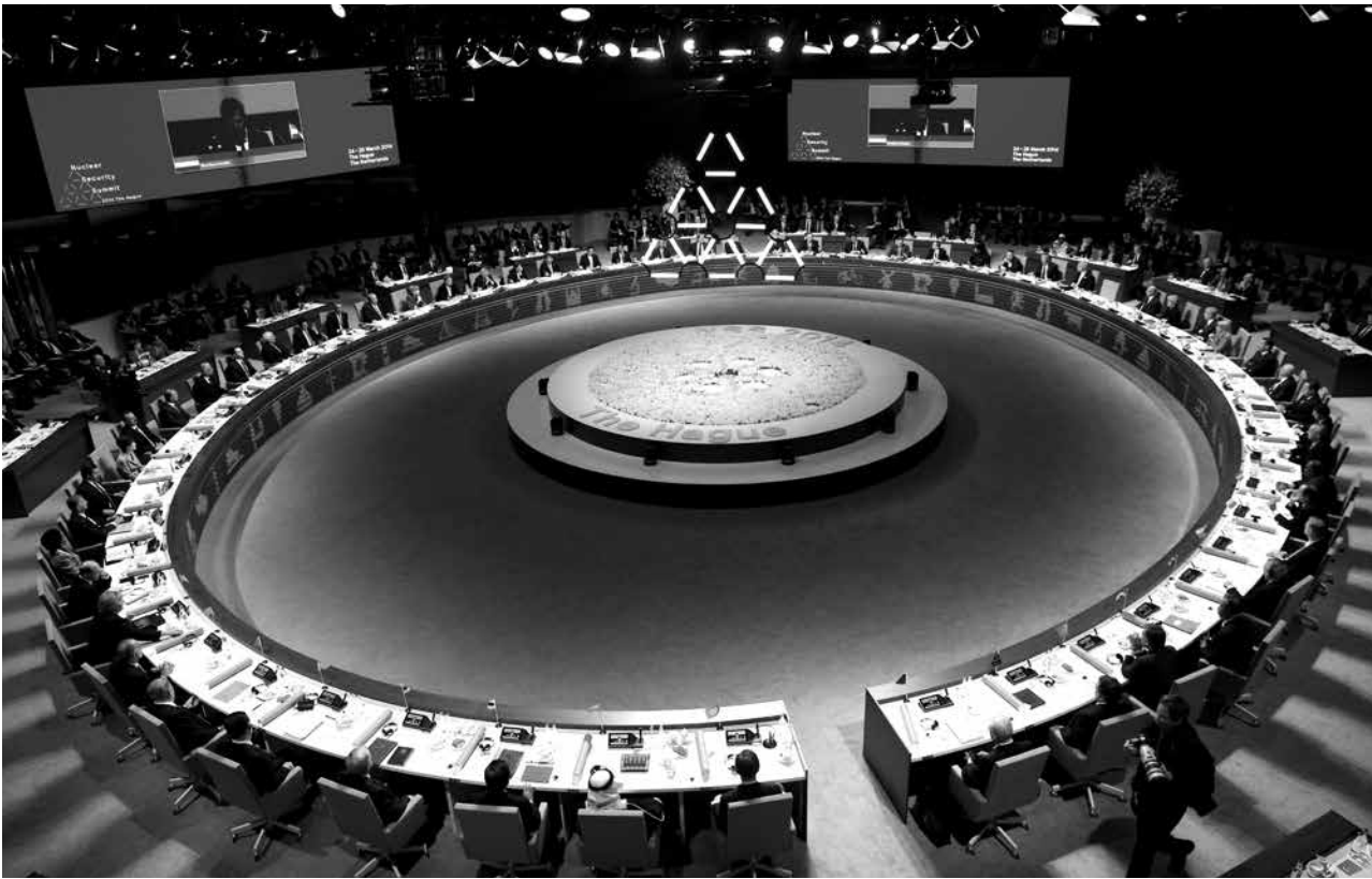
Leaders from 53 countries gathered in The Hague on March 24-25, 2014, for the third Nuclear Security Summit. Leaders signed on to multilateral initiatives to advance nuclear security in key areas at the summit.

Similar to the last edition of this report, the findings presented here support the conclusion that the more successful joint statements identified clear deliverables or outcomes. Such statements facilitated follow-up among participants and included reporting to the international community. They also targeted key gaps in national nuclear security regimes and the international governance system. Inclusion of such elements encourages accountability and provides the political impetus to complete the determined tasks. Joint statements with vague commitments and unclear timetables for implementation were less successful.