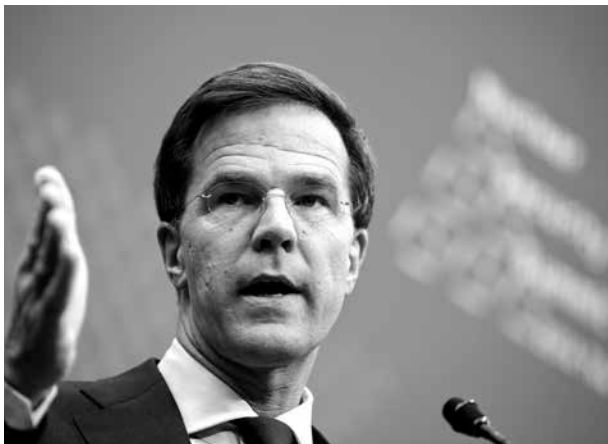
Dutch Prime Minister Mark Rutte addresses the media at the 2014 Nuclear Security Summit. The Netherlands hosted the third summit in The Hague on March 24-25.

It would be a significant loss to allow nuclear security gift basket diplomacy to end after the 2016 summit. The unique blend of high-level commitment making, time-bound follow-up, and targeted collaborative initiatives ignited action on long-held objectives, encouraged new countries to demonstrate leadership, and honed the focus of multilateral institutions with diverse constituencies and mandates. The joint statements, and the NSS process