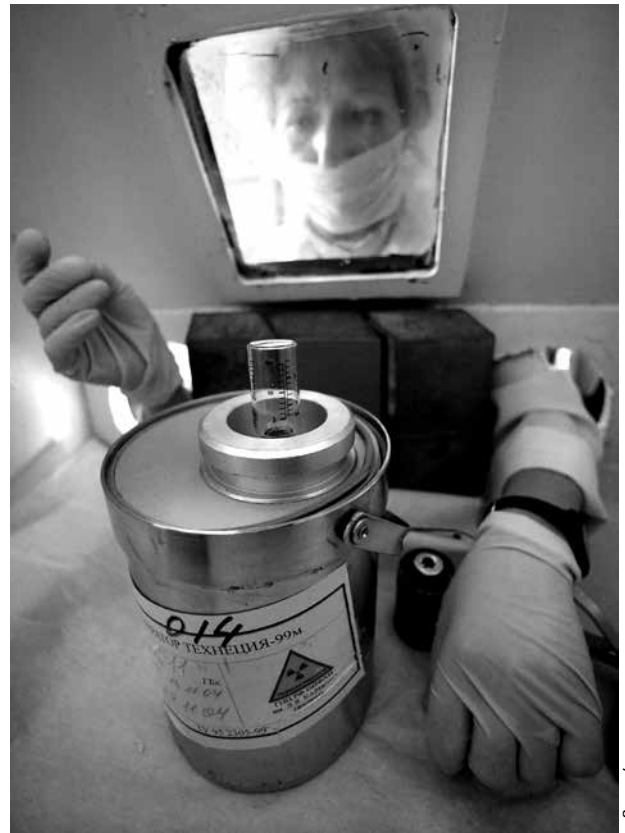
A Russian expert extracts radioisotopes from a container at a laboratory in Kaliningrad. Radioisotopes are widely used for medical treatments. Currently, the majority of medical isotopes are produced using highly-enriched uranium fuel.

IRE’s conversion efforts are running on schedule, according to Belgian officials. 15 IRE has worked closely with the United States to undertake the necessary research and development activities and technical investment studies, and the company communicates with U.S. colleagues through quarterly reports. IRE primarily irradiates targets at its BR-2 reactor, which is housed in the Nuclear Research Centre (SCK-CEN)