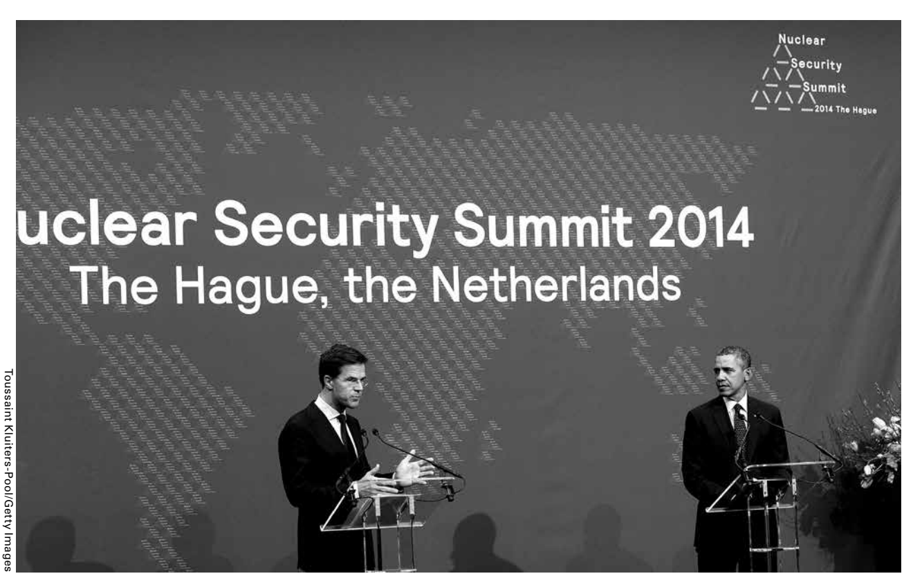
Dutch Prime Minister Mark Rutte and U.S. President Barack Obama address the media at the 2014 Nuclear Security Summit. The three summit hosts, the United States, the Netherlands, and the Republic of Korea co-led a joint statement on strengthening nuclear security implementation.

Finally, included in the initiative is a non-exhaustive list of more than a dozen additional actions that contribute to the continuous improvement of the nuclear security regime. Signatories agreed to take at least one of these additional actions ahead of the 2016 summit.