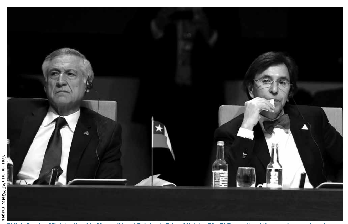
Chile's Foreign Minister Heraldo Munoz (L) and Belgium's Prime Minister Elio Di Rupo attend the opening session of the 2014 Nuclear Security Summit. Chile and Argentina held a joint exercise on responding to a nuclear or radiological terrorist attack in August 2014.

At the IAEA General Conference in September 2014, Finland announced that it would host the next plenary of the GICNT.