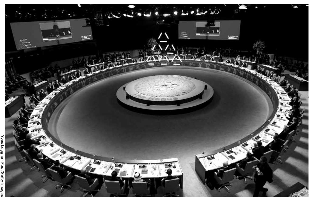
Leaders from 53 countries gathered in The Hague on March 24-25, 2014, for the third Nuclear Security Summit. Leaders signed on to multilateral initiatives to advance nuclear security in key areas at the summit.

Similar to the last edition of this report, the findings presented here support the conclusion that the more successful joint statements identified clear deliverables or outcomes. Such statements facilitated follow-up among participants and included reporting to the international community. They also targeted key gaps in national nuclear security regimes and the international governance system. Inclusion of such elements encourages accountability and provides the political impetus to complete the determined tasks. Joint statements with vague commitments and unclear timetables for implementation were less successful.