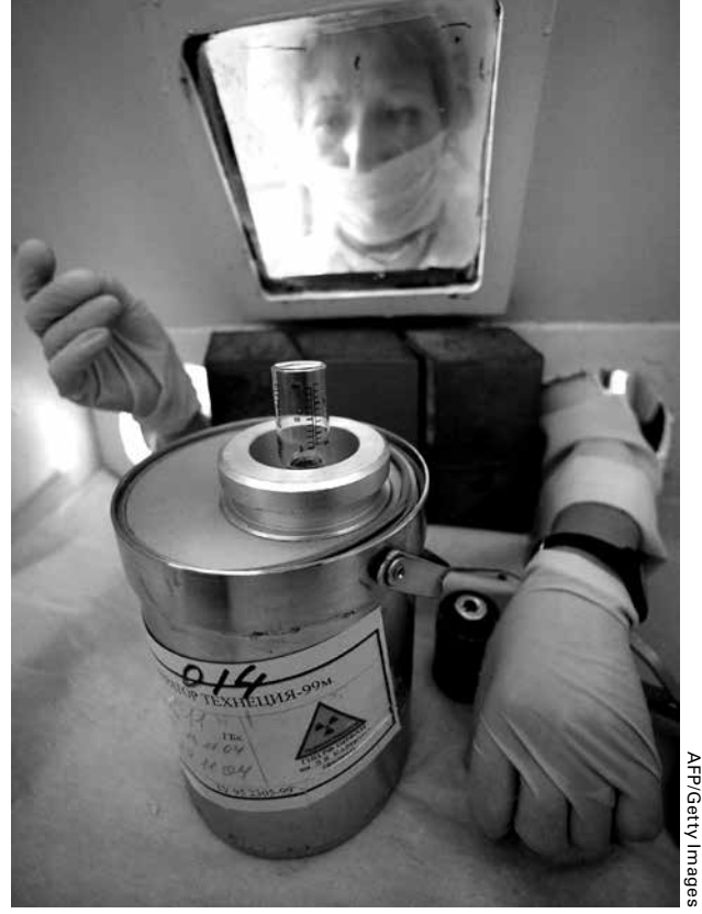
A Russian expert extracts radioisotopes from a container at a laboratory in Kaliningrad. Radioisotopes are widely used for medical treatments. Currently, the majority of medical isotopes are produced using highly-enriched uranium fuel.

IRE's conversion efforts are running on schedule, according to Belgian officials.<sup>15</sup> IRE has worked closely with the United States to undertake the necessary research and development activities and technical investment studies, and the company communicates with U.S. colleagues through quarterly reports. IRE primarily irradiates targets at its BR-2 reactor, which is housed in the Nuclear Research Centre (SCK-CEN)