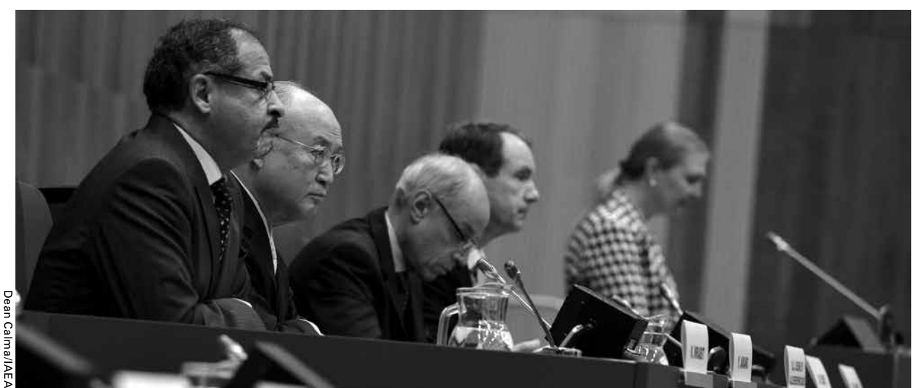
The IAEA hosts an international conference on the advances in nuclear forensics in Vienna in July 2014.

Ahead of The Hague summit, experts from 30 countries—most of which participate in the NSS process and are signatories of the joint statement—met in January 2014. Based on NFI's work and the information shared through the education platform and compendium, participants identified areas of nuclear forensics where more work is needed. These areas include: national response plans, further education and training exercises, maintaining the lexicon and knowledge platform, further development of forensics methodologies, and collaboration mechanisms for cross-border incidents.