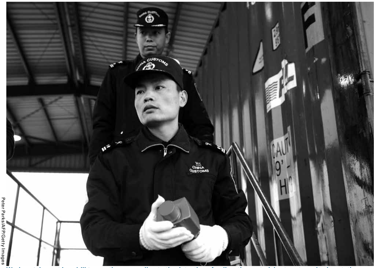
Workers take part in a drill to practice responding to the detection of radioactive materials at port monitoring station. Signatories of the radiological security joint statement committed to consider implementing best practices for notifying neighboring countries and the IAEA in the event of an incident.

The signatories of the 2012 and 2014 statements are different. Algeria, Armenia, Georgia, Germany, Lithuania, the Netherlands, Turkey, the United Kingdom, and the United States were new signatories in 2014. Finland, Indonesia, Malaysia, Philippines, Poland, Singapore, Spain, Switzerland, and Thailand were signatories in 2012 that chose not to endorse the statement in 2014.