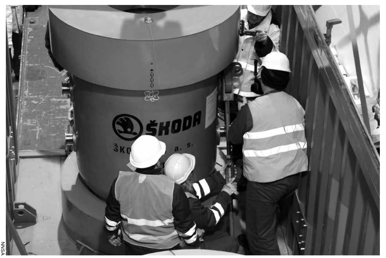
The United States assists in removing highly-enriched uranium from the Czech Republic in 2013. The United States committed to working with four other countries to provide assistance to improve the security of nuclear and radiological materials in transit.

in domestic and international transport. This includes exchanging information on the physical protection of materials in all modes of transport to identify best practices and lessons learned.