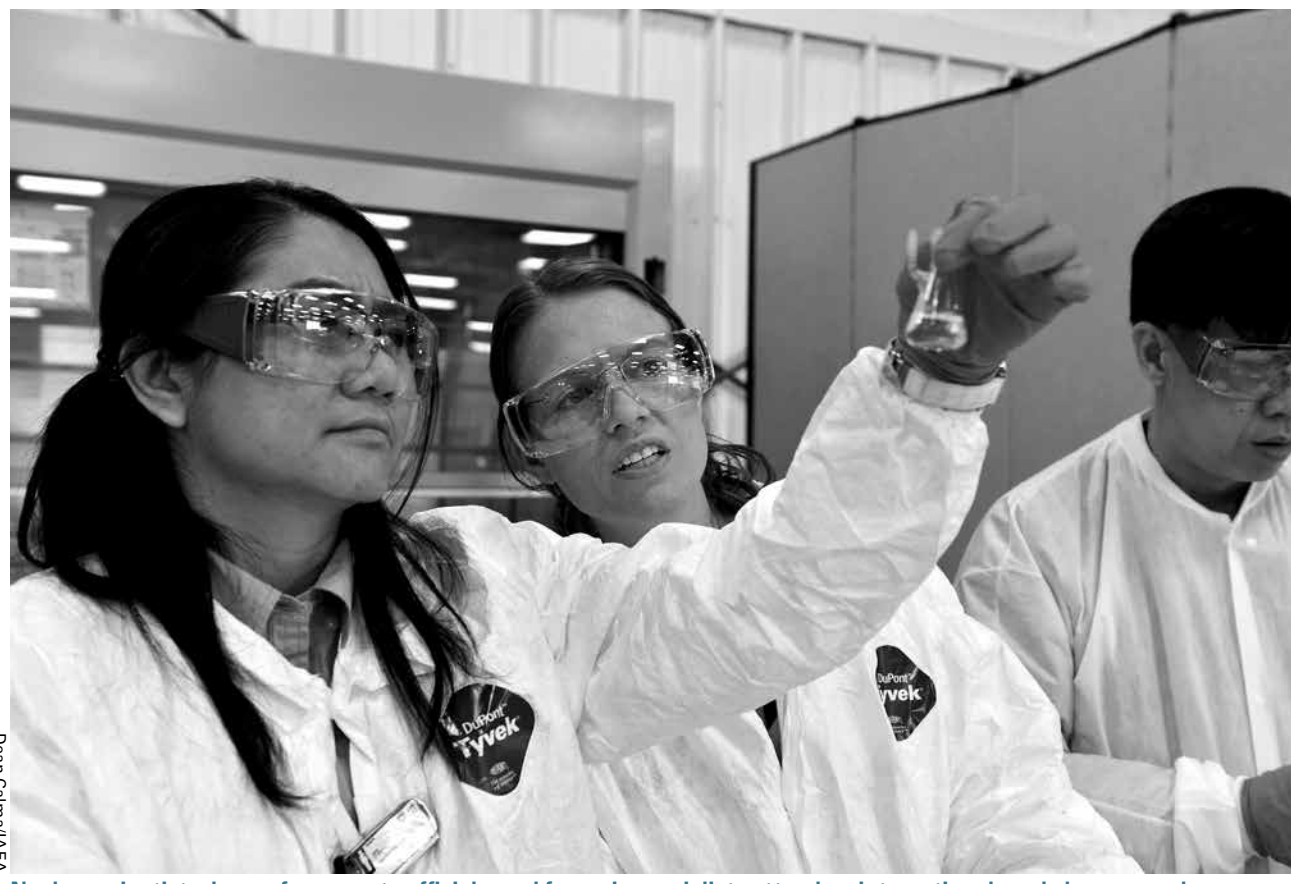
Nuclear scientists, law enforcements officials, and forensic specialists attend an international workshop on nuclear forensics at the Pacific Northwest National Laboratory in Richland, Washington. The United States contributed to the Dutch-led joint statement on strengthening nuclear forensics procedures.

The Netherlands Forensics Institute (NFI) began