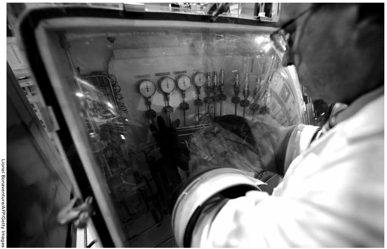
An employee of French Atomic Energy Commission works at a reactor. France committed to working with three countries to convert medical isotope production in Europe to use low-enriched uranium fuels.

In its 2014 national progress report, France reaffirmed its support to minimize the use of HEU in medical isotope production, when technically and economically feasible. The statement notes that the French company CIS-bio International has succeeded in adjusting its market authorization to distribute LEU-based Mo-99 in Europe and already has distributed its first productions, which came from South African LEU-based Mo-99.