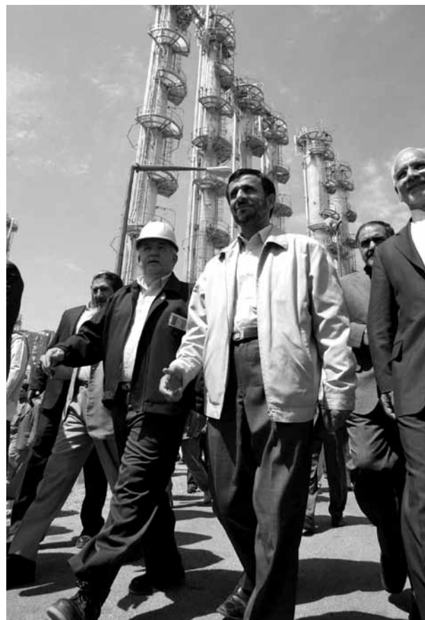
Iranian President Mahmoud Ahmadinejad (center) at the opening ceremony for the heavy water production plant in Arak in August 2006.

The United States, for instance, already has recognized Iran's right to enrich uranium if it is in compliance with its safeguards obligations. Secretary Clinton's aforementioned testimony made it clear that the United States would support Iran enriching uranium in the future under strict IAEA supervision once the concerns of the international community were resolved. Clinton also said in the March 1, 2011 testimony that she thought that this was the position of the international community.