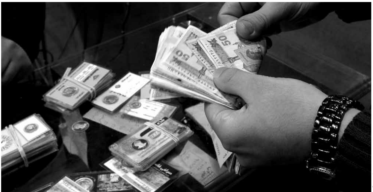
An Iranian man counts banknotes after exchanging a gold coin for cash in Tehran on January 23, 2012. Sanctions against Iran have caused the value of the country's currency, the rial, to drop dramatically.

Most significantly, since 1996 when Congress approved the Iran and Libya Sanctions Act, the United States has had in place legislation that is intended to deter foreign entities from carrying out any significant investment in Iran's oil and gas industries. Legislation passed by Congress in July 2010 expanded the application of the bill to deter foreign companies from selling refined oil products such as gasoline to Iran as well as equipment or services that could contribute to Iran's ability to produce refined petroleum domestically. Foreign entities that are found