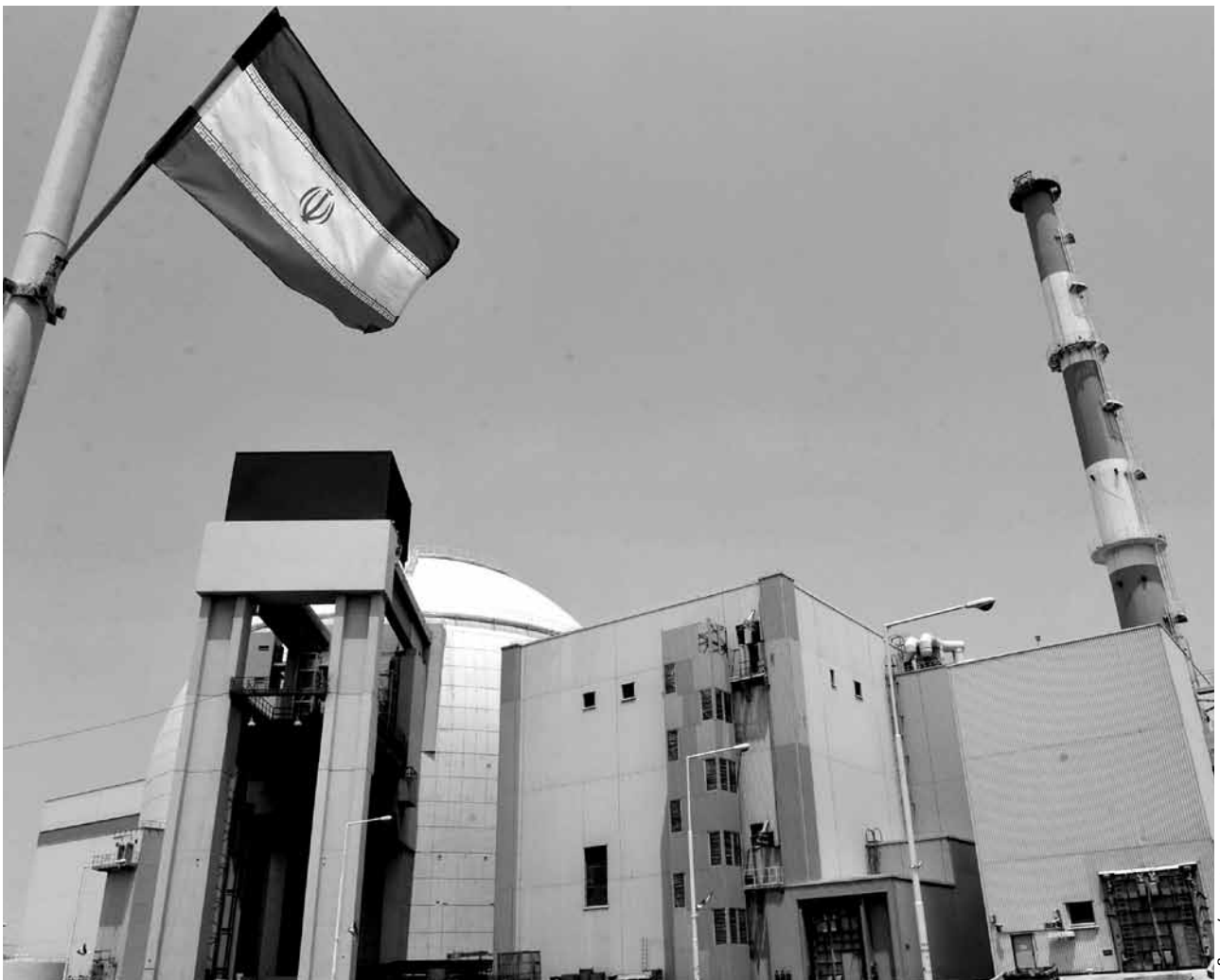
In August 2010 the first fuel is loaded into Iran’s sole nuclear power plant, Bushehr, which is operated by the Russians. Russia also supplies the enriched uranium to fuel the plant.

JUNE 9, 2010: The UN Security Council adopts Resolution 1929, significantly expanding sanctions against Iran. In addition to tightening proliferation-related sanctions and banning Iran from carrying out nuclear-capable ballistic missile tests, the resolution imposes an arms embargo on the transfer of major weapons systems to Iran. It highlights the connection between the revenues from Iran’s energy sector and its nuclear and missile programs, providing some basis for the European Union to adopt restriction on Iran’s oil and gas