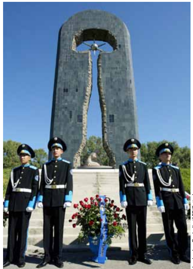
This memorial commemorates the victims of the 456 nuclear tests conducted by the Soviet Union at the Semipalatinsk Test Site in Kazakhstan.

The 2010 report focused on 11 states particularly relevant to nuclear disarmament and nonproliferation and divided them into three categories based on their current status: nuclear-weapon states, non-NPT states, and states of concern. This report covers the same