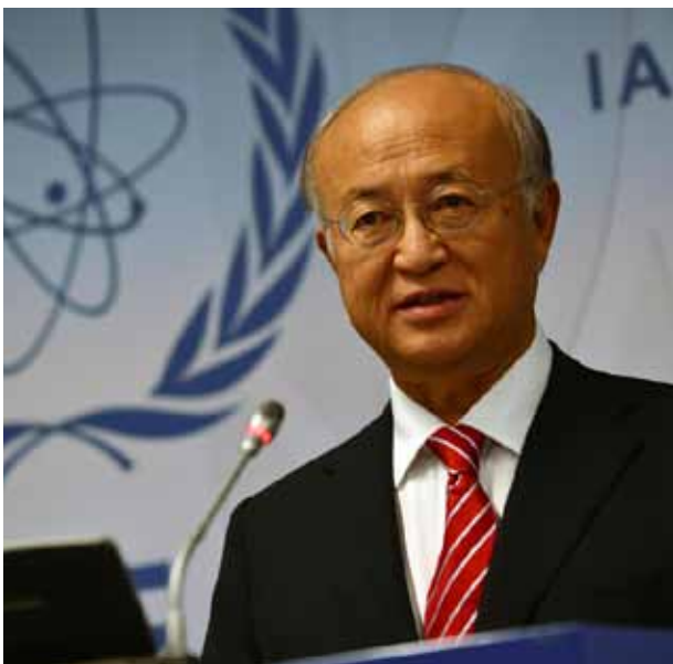
IAEA Director General Yukiya Amano speaks during an Agency meeting in September 2012. The IAEA plays a central role in the nonproliferation regime.

Since the early 1990s, however, the international community has recognized that full-scope safeguards are insufficient for providing assurance against undeclared nuclear activities in a state. The failure of traditional IAEA safeguards to detect illicit nuclear activities in Iraq, as well as problems in verifying North Korea's nuclear program, prompted the strengthening of agency safeguards and the development of the 1997 Model Additional Protocol. That protocol, which states adopt as an enhancement to their safeguards agreements, provides the agency with greater authority and tools to investigate all of