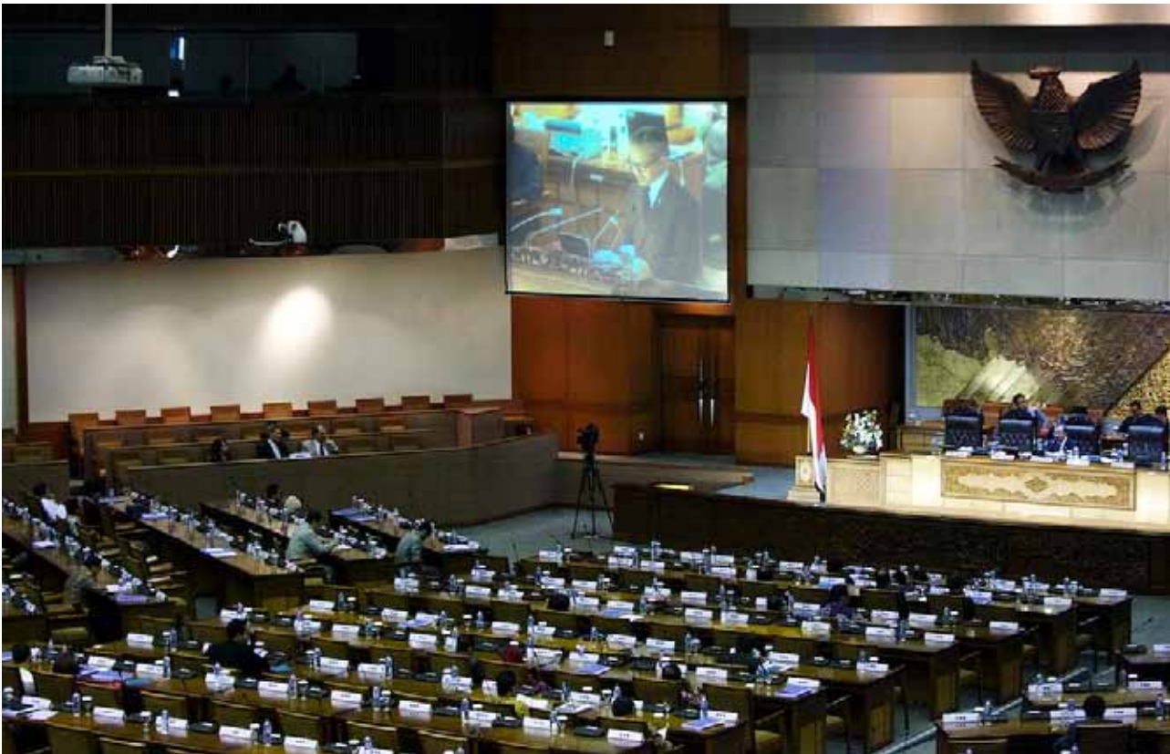
CTBTO Preparatory Commission