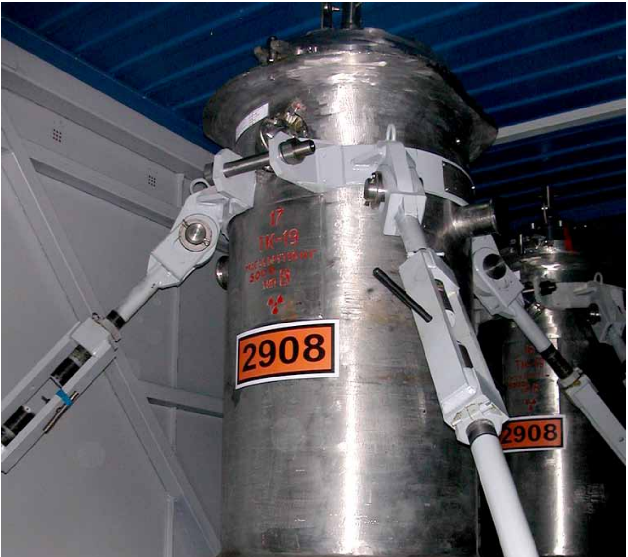
Russia successfully recovered all of its highly enriched uranium from Romania, in cooperation with the U.S. National Nuclear Security Administration. The material was moved to Russia for secure storage.

Russia issued unilateral pledges not to attack non-nuclear-weapon states with nuclear weapons in 1978 and 1995. Moscow has indicated that those pledges would not apply in cases in which it was attacked by a non-nuclear-weapon state in association with a nuclear-weapon state. 87 In that same statement, Russian officials appear to have asserted that Moscow may use nuclear weapons against an ally of a nuclear-armed state even if it has not been attacked.