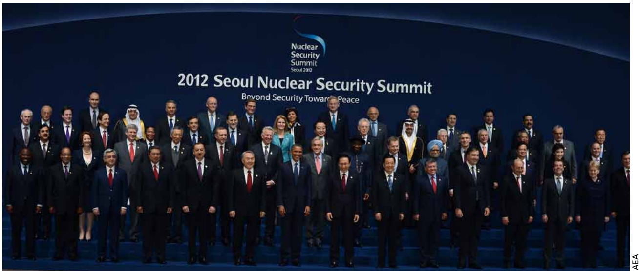
Leaders from 53 countries met in Seoul in March 2012 to advance the goal of securing vulnerable nuclear material and strengthening multilateral nuclear security initiatives.

force have endorsed the adoption of such zones, including the 1995 Resolution on the Middle East calling for the creation of a zone free of nuclear weapons and other weapons of mass destruction in that region. That decision was integral to the indefinite extension of the treaty. At the 2010 NPT Review Conference, states-parties decided that a conference on a Middle East WMD free zone should be convened by 2012. Furthermore, in the 2000 and 2010 NPT review conferences, states-parties agreed that the establishment of NWFZs “enhances global and regional peace and security, strengthens the nuclear nonproliferation regime and contributes towards realizing the objectives of nuclear disarmament.”