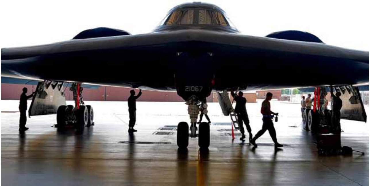
U.S. Air Force