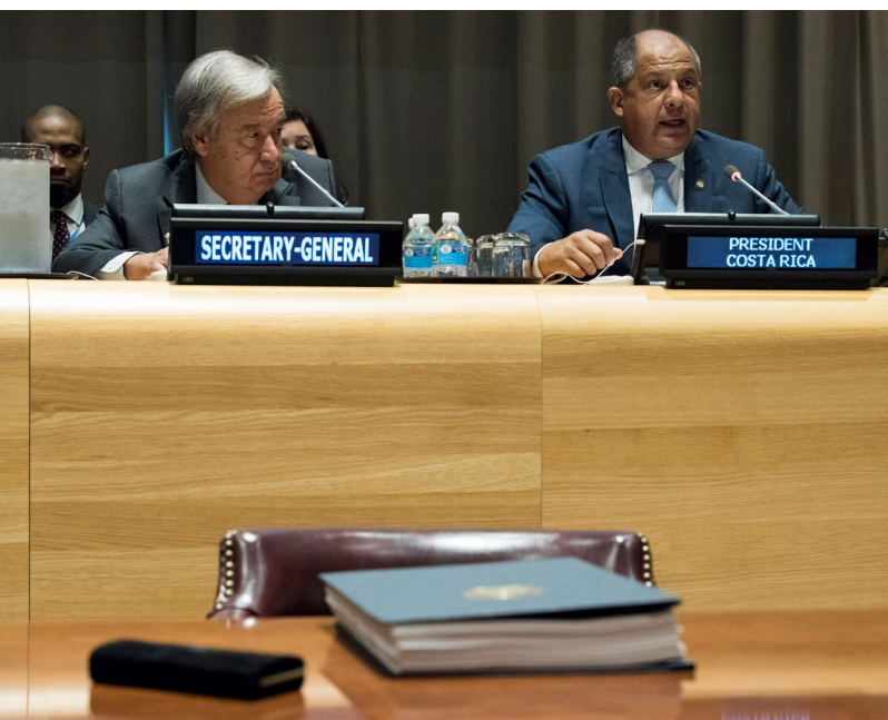
UN Secretary-General António Guterres (left) and Luis Guillermo Solís Rivera, president of Costa Rica, preside over the signing ceremony of the Treaty on the Prohibition of Nuclear Weapons at the United Nations on July 7, 2017.