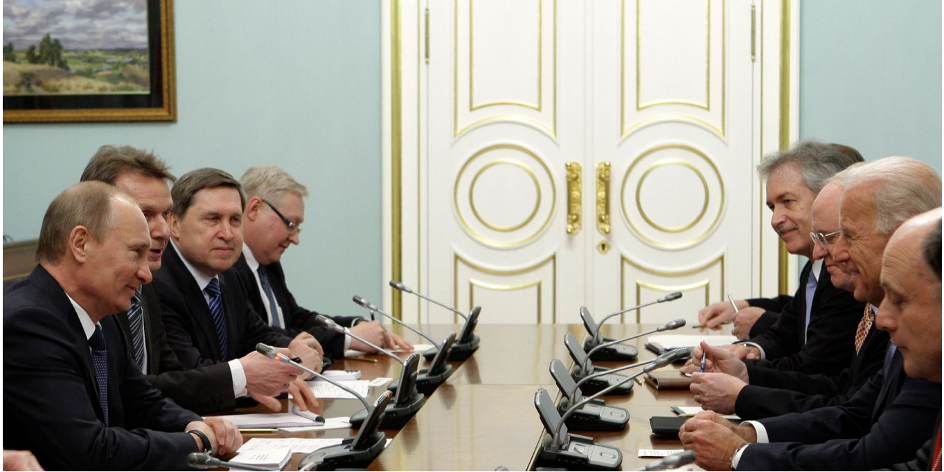
Russian Prime Minister Vladimir Putin (L) and then-U.S. Vice President Joe Biden (2nd R) meet on March 10, 2011 with their delegations in Moscow.

proposal by offering a one-year extension and a one-year warhead freeze on the condition that the freeze not be accompanied by any definitions, declarations, data exchanges, or verification. The Russian position was dismissed by the Trump administration as a fake freeze.