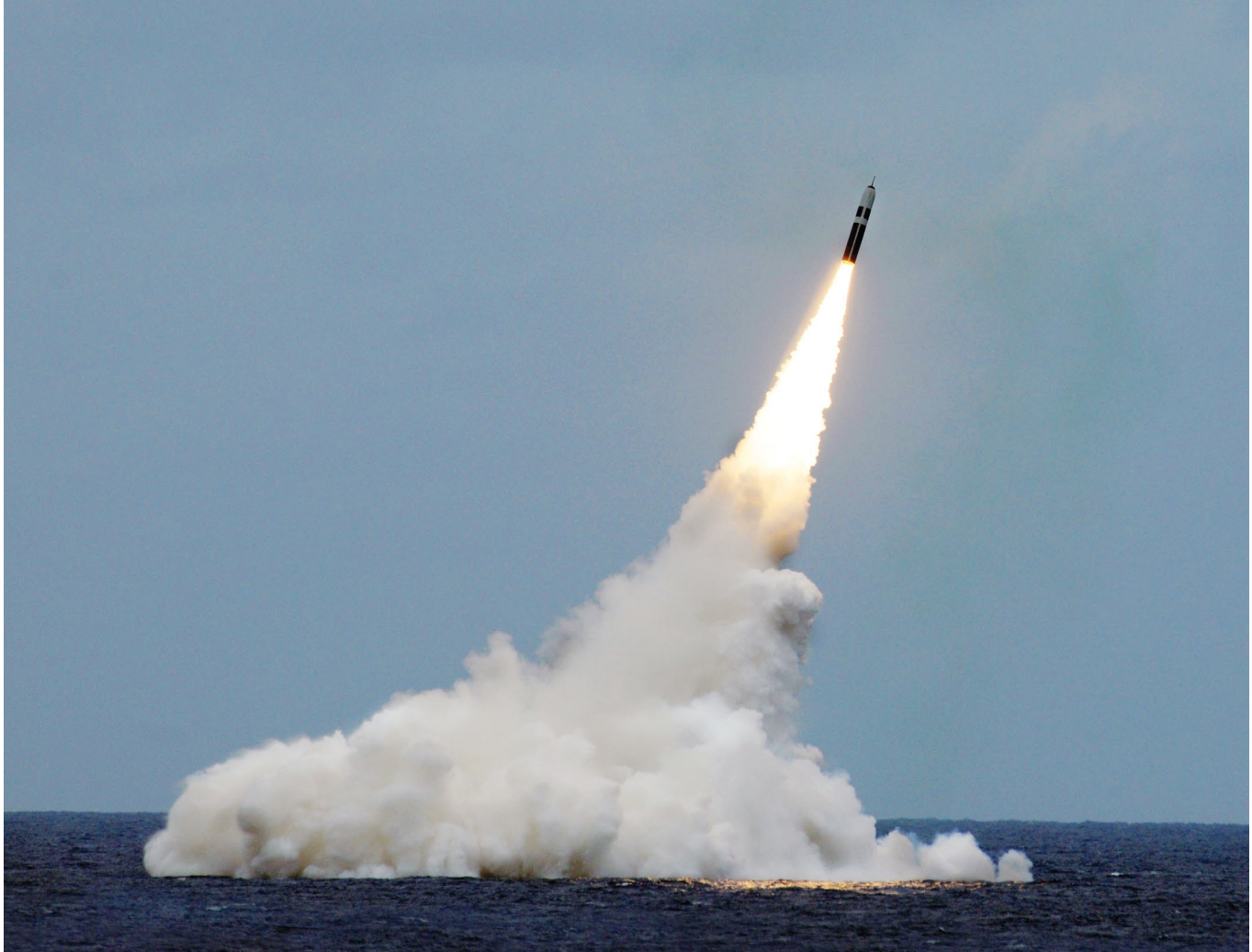
An unarmed Trident II D5 ballistic missile launches from the Ohio-class submarine USS Maryland (SSBN 738) off the coast of Florida on August 31, 2016. The test launch was part of the U.S. Navy Strategic Systems Programs certification process.