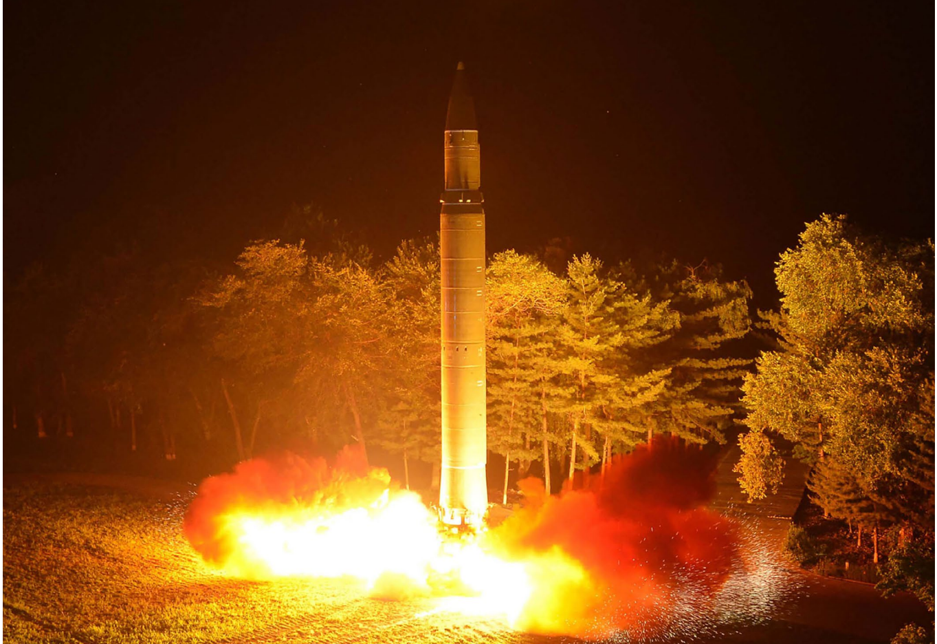
This July 28, 2017 picture released from North Korea's official Korean Central News Agency (KCNA) on July 29, 2017 shows North Korea's intercontinental ballistic missile (ICBM), Hwasong-14 being launched at an undisclosed place in North Korea. Kim Jong-Un boasted of North Korea's ability to strike any target in the United States after a second ICBM test that weapons experts said could even bring New York into range.

a new ICBM significantly larger and more powerful than prior systems. Despite ending the moratorium, North Korea has not resumed nuclear or long-range missile tests. While the nuclear testing pause prevents the country making certain qualitative advances to its warhead designs, Pyongyang continues to produce fissile material for its nuclear weapons program and has resumed testing short-range and medium-range ballistic missiles.