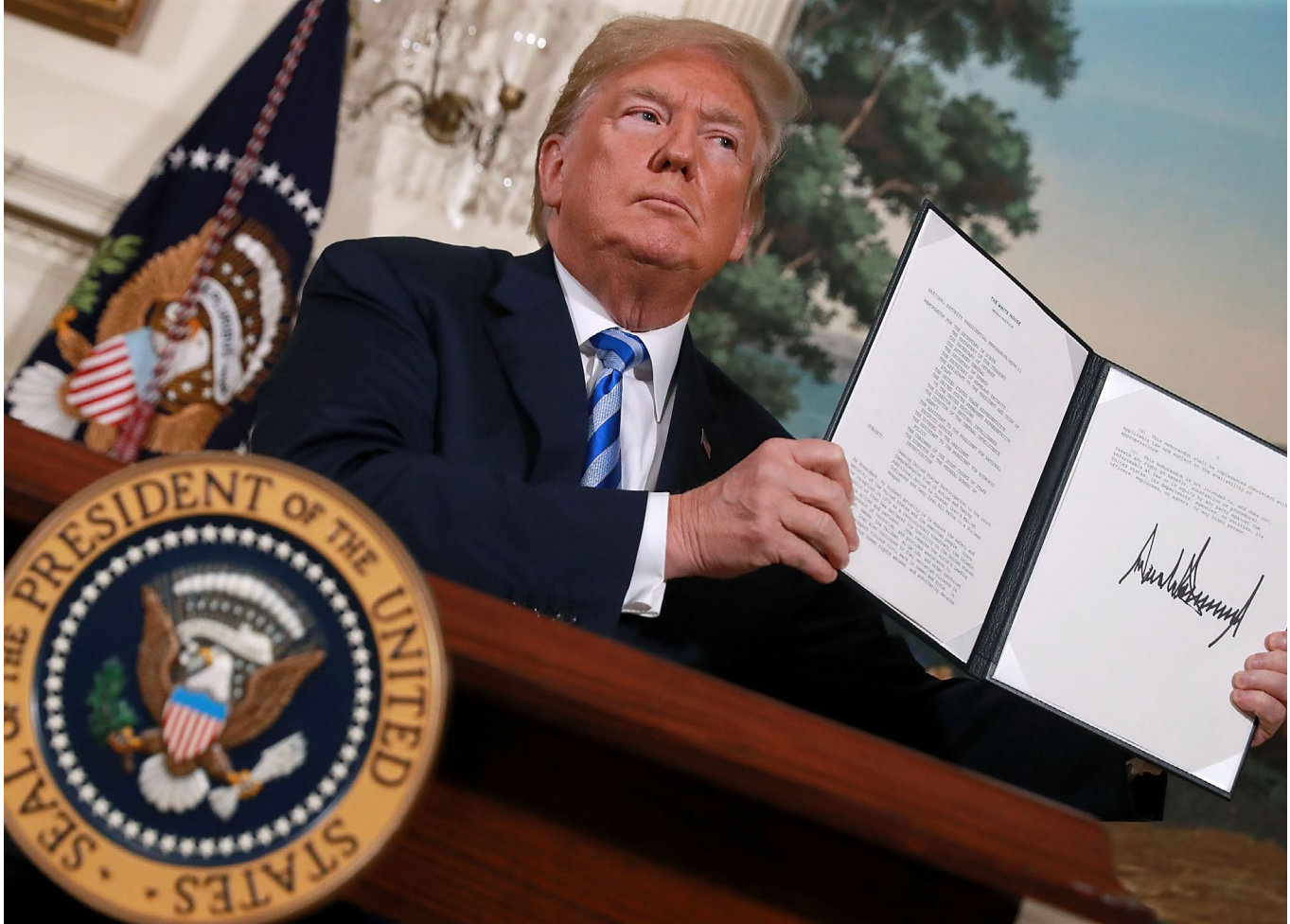
U.S. President Donald Trump displays his order reinstating sanctions on Iran after he announced his decision to withdraw the United States from the 2015 Iran nuclear deal in the Diplomatic Room at the White House on May 8, 2018.