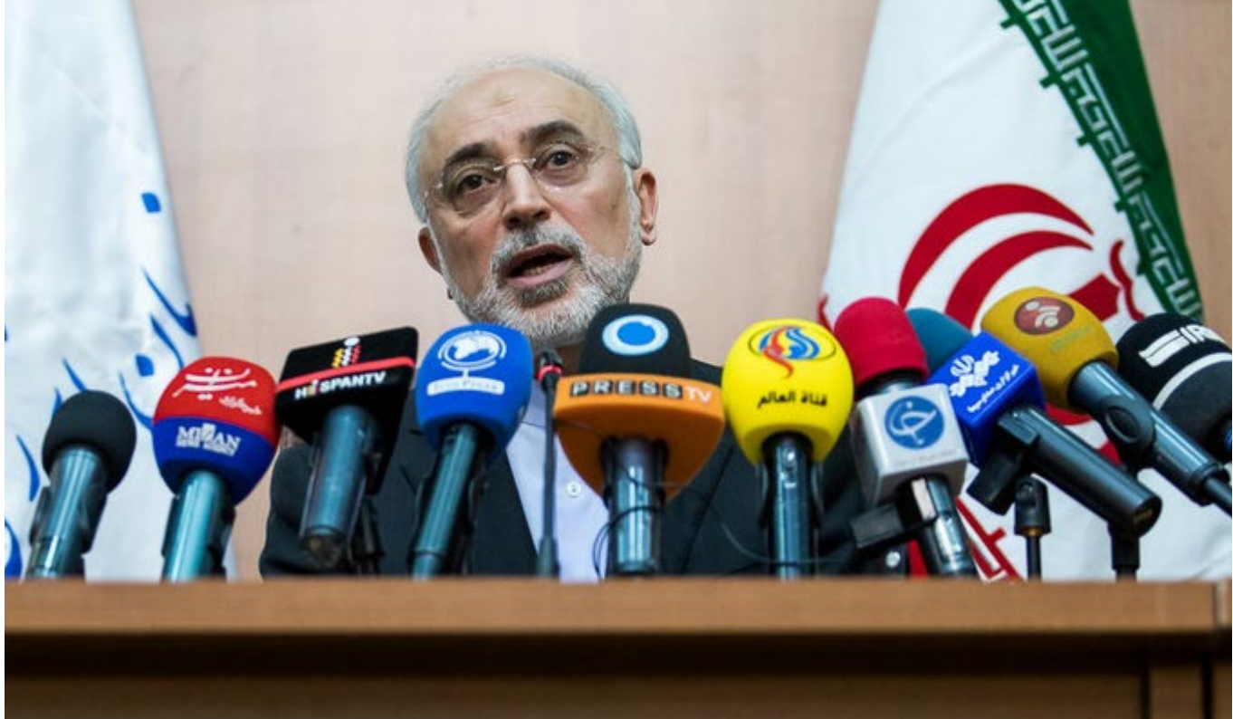
Ali Akbar Salehi, head of the Atomic Energy Organization of Iran speaks to the media in June 2018. Iran has responded to Trump's decision to abandon the JCPOA by breaching several nuclear limits.