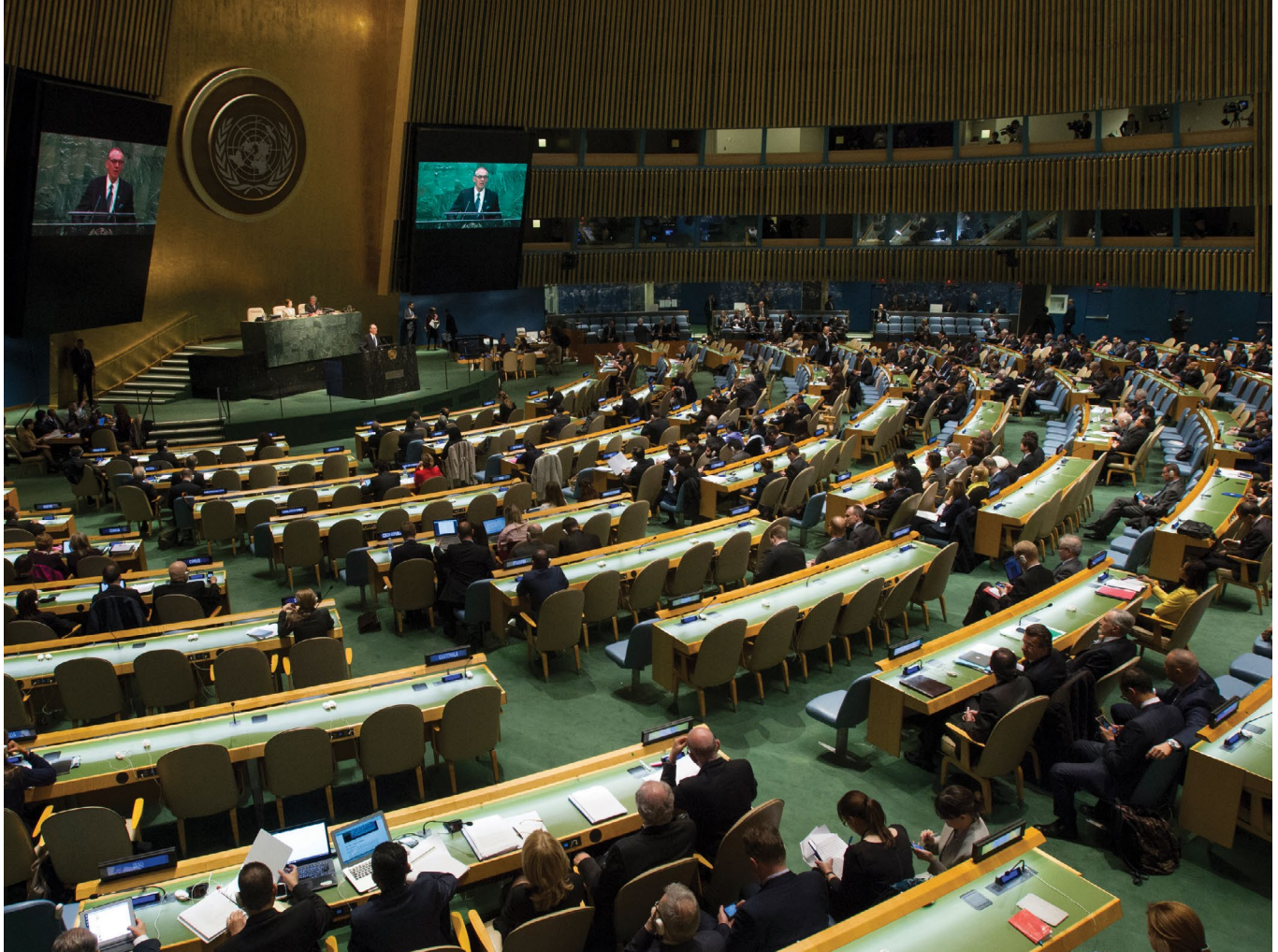
UN Deputy Secretary-General Jan Eliasson opens the 2015 Nuclear Nonproliferation Treaty Review Conference in New York on April 27, 2015.

Trump officials also adopted a confrontational approach toward the 2017 Treaty on the Prohibition of Nuclear Weapons and the 100+ states that negotiated the treaty as a good faith effort to help meet their NPT disarmament obligations. Such excuses and blame-shifting by Trump officials were unconstructive and divisive. Rejecting previous NPT commitments demeans the NPT process, casts doubt on the value of any new commitments, and adds to the growing stress on the nonproliferation system.